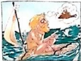
cross the ocean