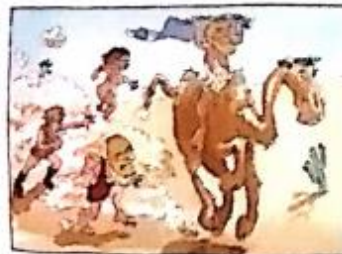
walk or ride